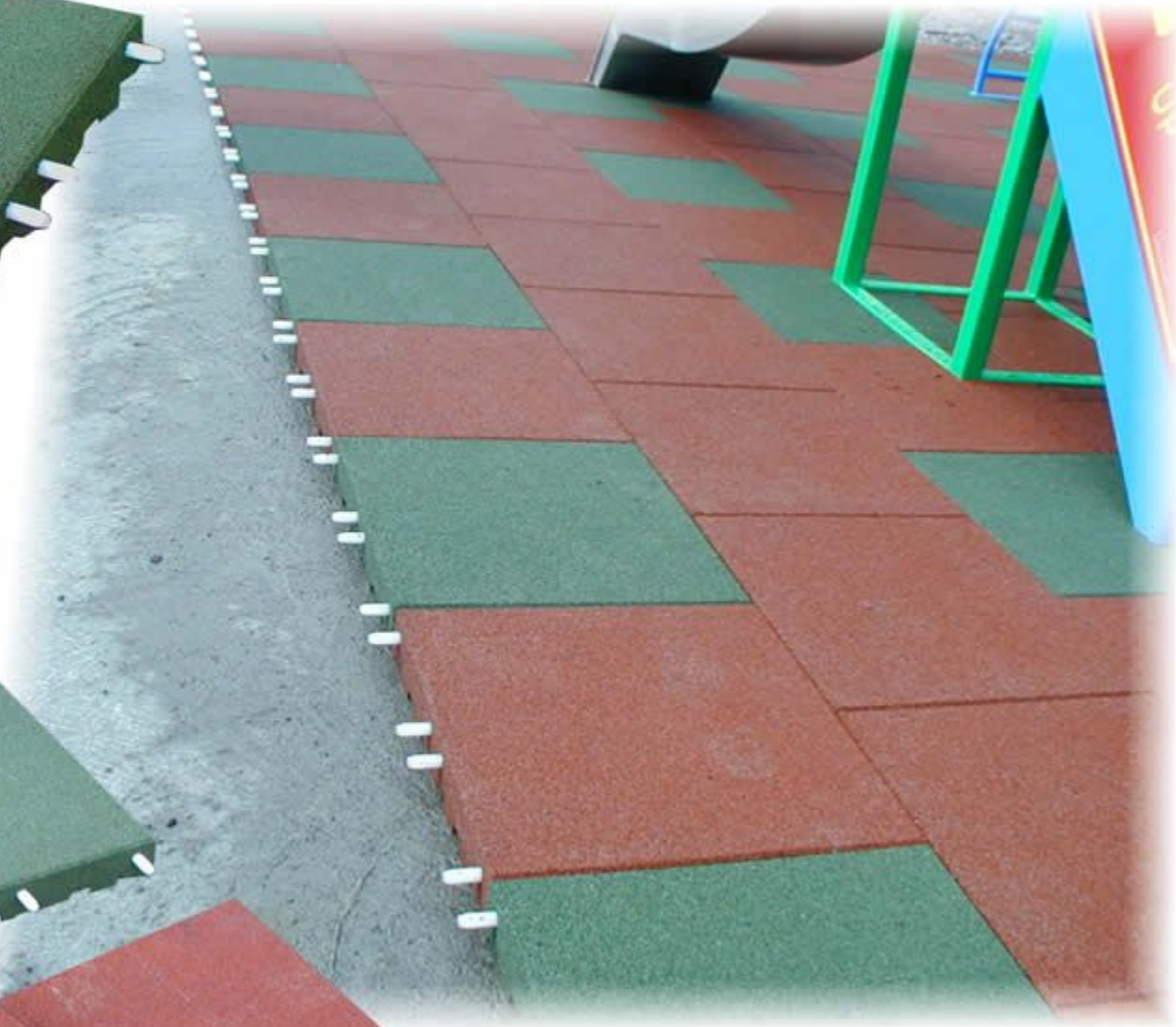
Safety Tiles after being laid around playground equipment on floated concrete slab